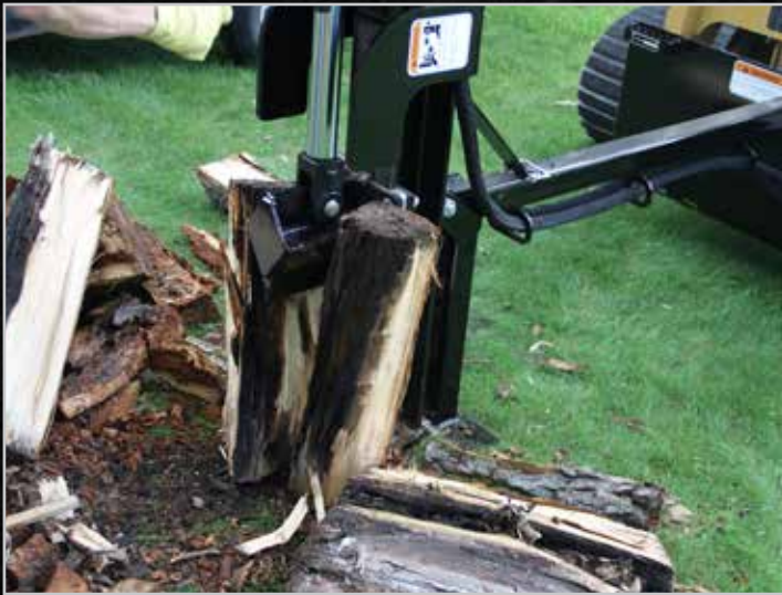
Heavy-Duty I-beam construction.