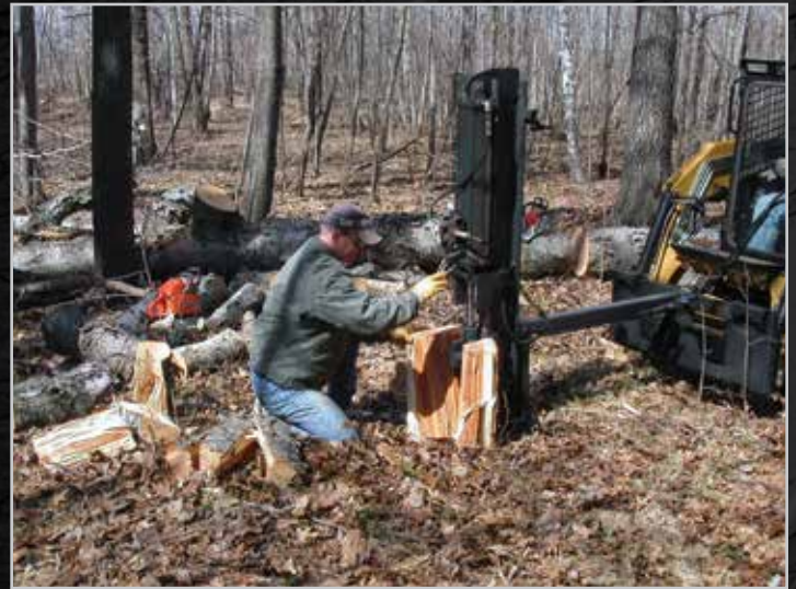
Forward and reverse control.