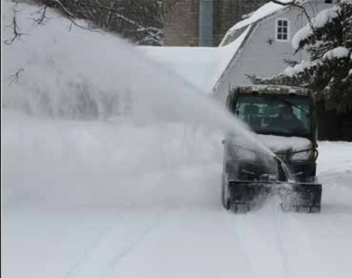
12" open flight auger, 16" 4-blade fan design