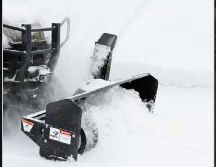
60" cutting width