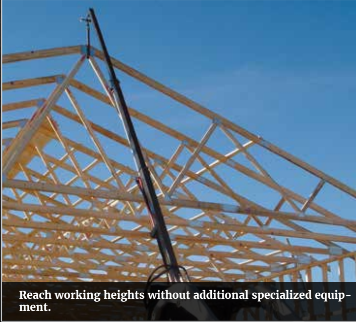
Reach working heights without additional specialized equipment.