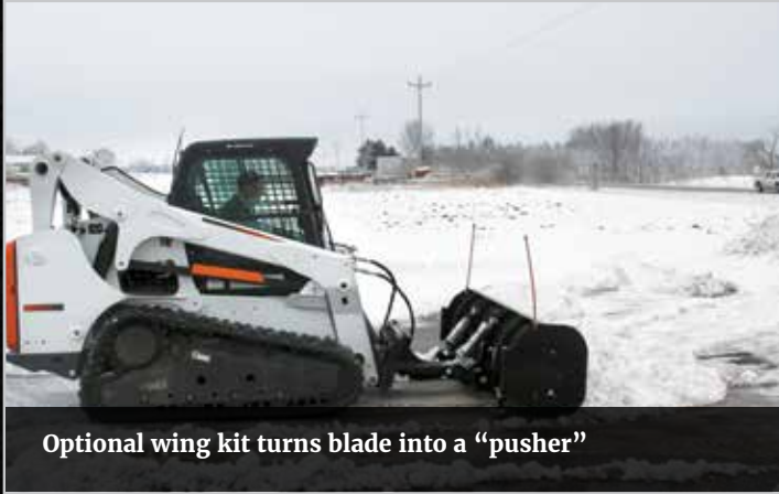
Optional wing kit turns blade into a "pusher"