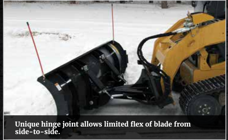
Unique hinge joint allows limited flex of blade from side-to-side.