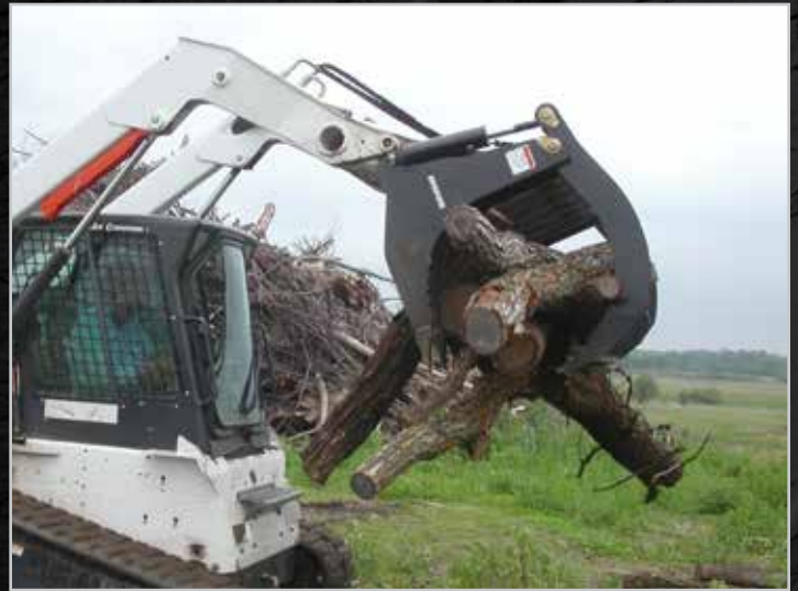
Unique serrated edges provide grip to prevent items from rolling out