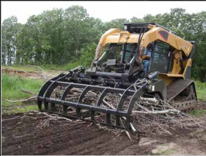
Top teeth 1/2" thick T1 steel