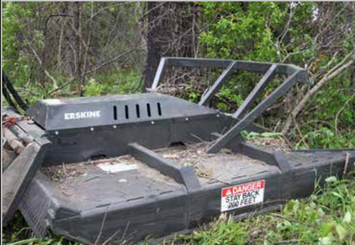
Break new trails, clear ditches, construction, property sites, and other overgrown areas.